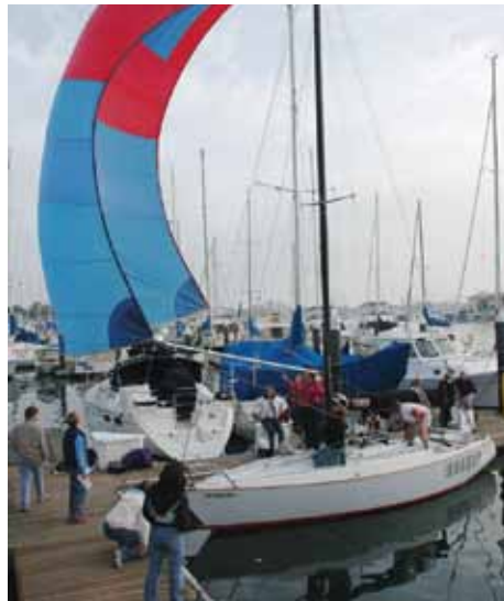
Spinnaker Rigging Workshop

These programs can be one-day or summer-long activities. Mentoring these young girls can bring great rewards. Local volunteers coordinate the events with our help and promotion. Won't you call us today and volunteer to put on an AdventureSail® event in your town? Call our toll-free number for more information.