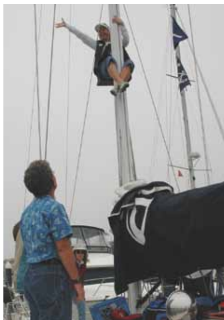
"Going Up the Mast" Workshop at SCYA Women's Sailing Convention in February.