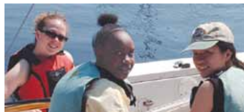
Girls enjoy sailing on Rhodes 19 in Boston Harbor

The day couldn't have been more perfect for 16 pairs of big and little sisters of the Greater Boston Association of Big Sisters who gathered at the Courageous