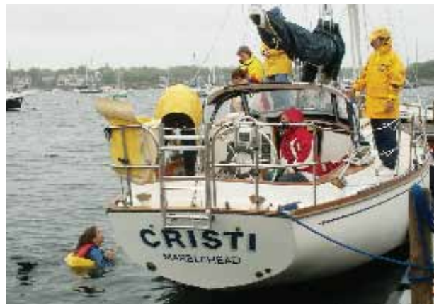
Man over board workshop despite strong winds & rain!